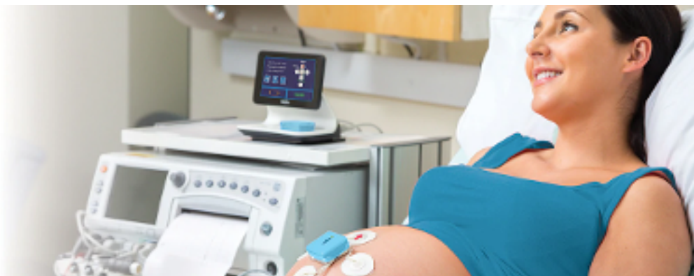
GE Healthcare: Fetal Monitoring Systems

For now, stay tuned for some exciting online content and giveaways in the near future.